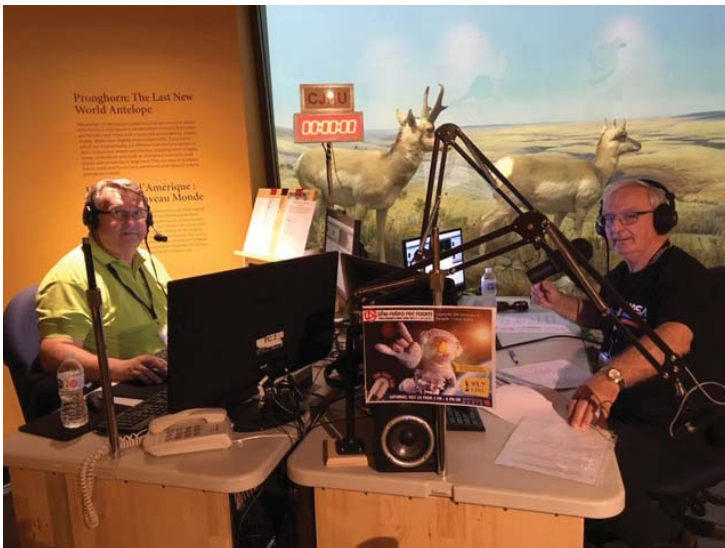
Manitoba Museum: CJNU Nostalgia Radio (July 20)

profit and charitable organizations, in addition to providing personal CJNU representation time permitting. Here's just a sample of these activities. 🎵