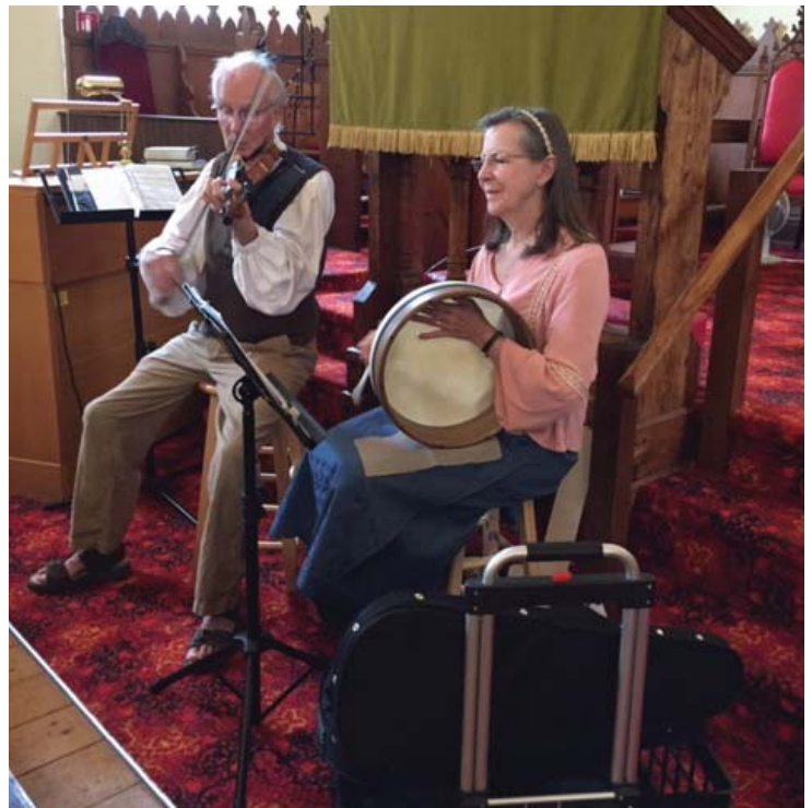
Old St. Andrews Anglican Church: Celtic Folk Music by Gosh and By Golly (July 17)