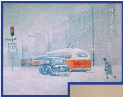
As described in Question 2 - the best gift Alex ever received.